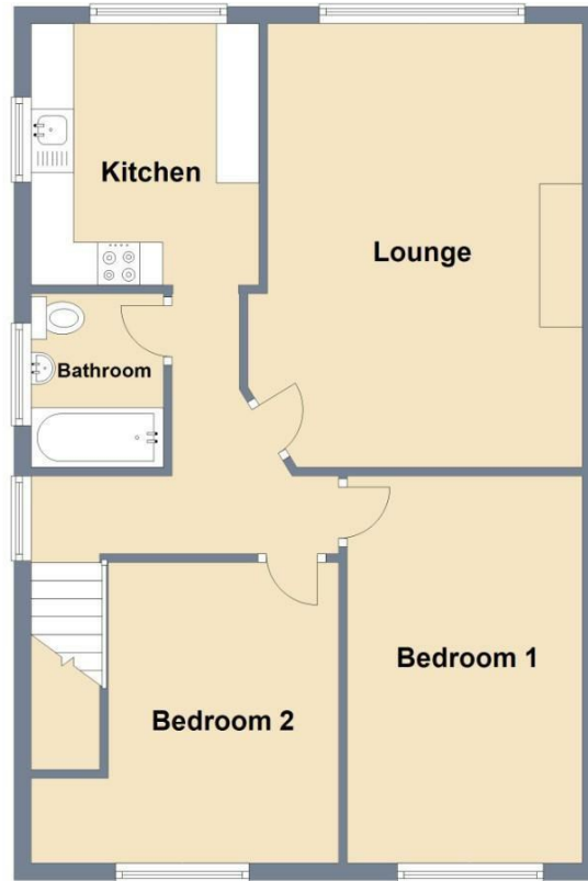
First Floor Approx. 63.8 sq. metres (686.9 sq. feet)